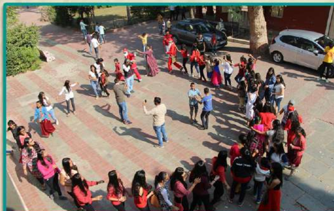
Visit to the school of deaf and dumb