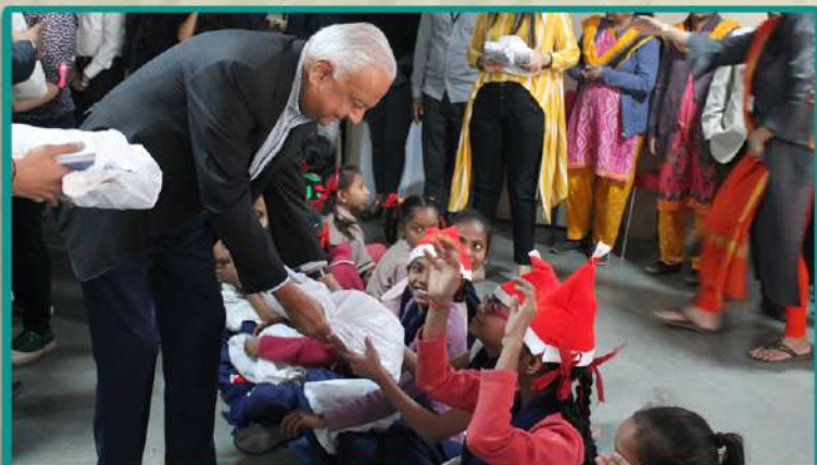
Celebration of New year eve with children from Municipal school