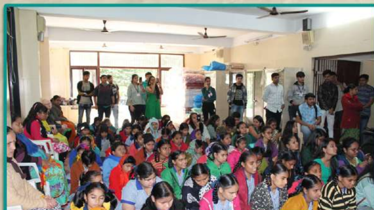
Visit to Andh Kanya Prakash Gruh