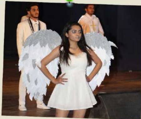
'Facets' Fashion Show