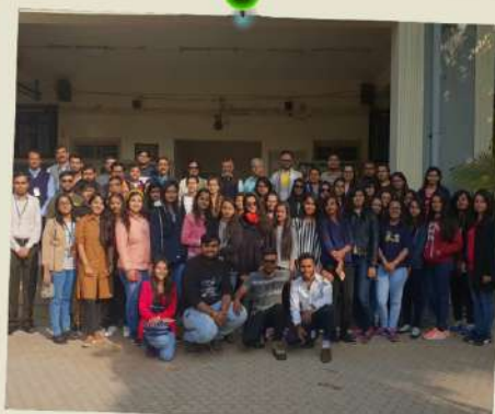
Visit to BJVM