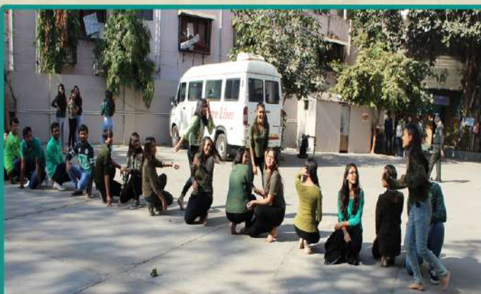
Go Green Day