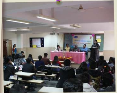
Gandhian Elocution Competition