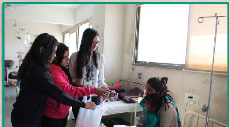
Visit to Children Cancer Ward Civil Hospital.