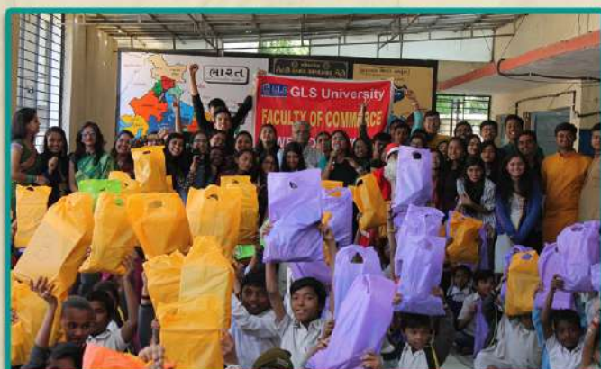
Visit to Municipal School 26, Amabawadi