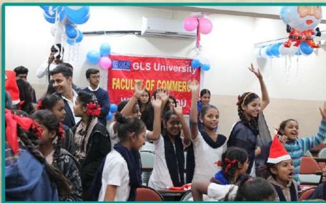
Celebration of New year eve with children from Municipal school