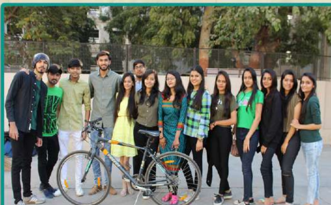
No Vehicle Day