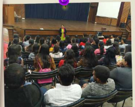
Visit to IRMA