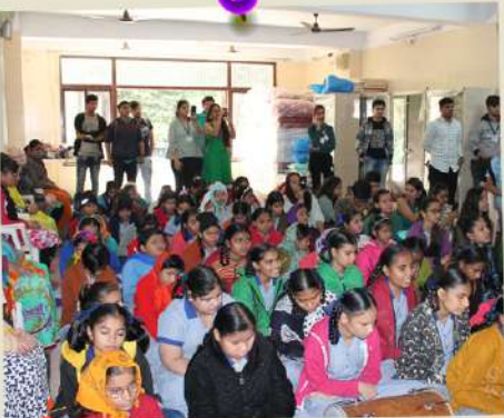
Visit to Prakash Andh Kanya Shala