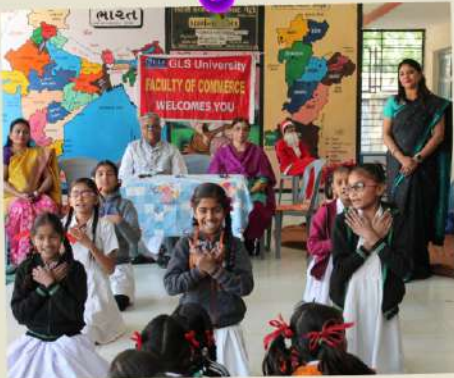
Visit to Municipal School No 26