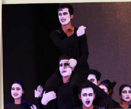
Skit Under CWDC