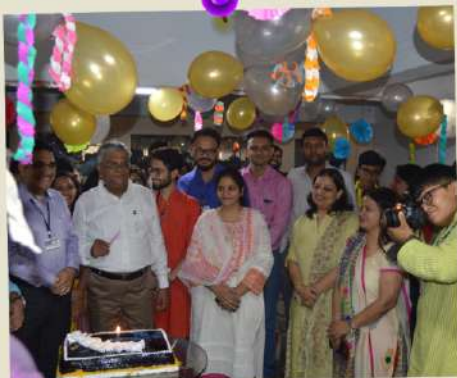
Teacher's day celebration