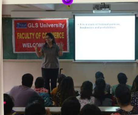
Personality Development Workshop