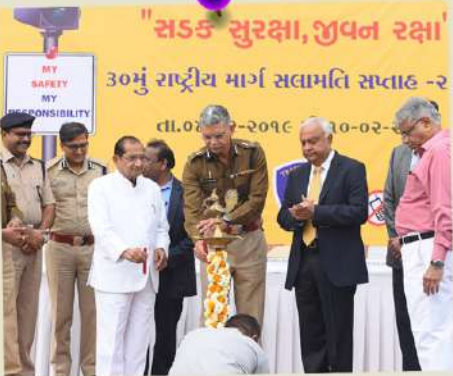
Traffic Awareness Drive