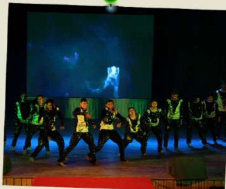
'Facets' Theme Dance