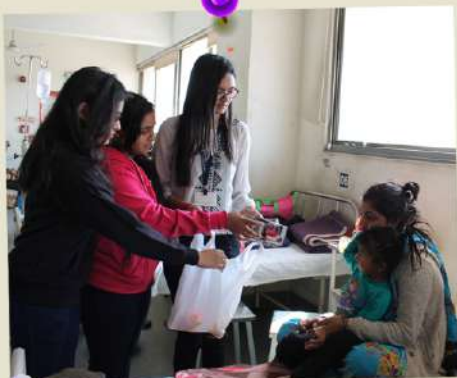
Visit to Cancer Hospital