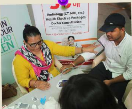
Health Check up