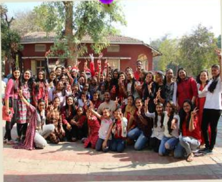
Visit to Deaf and Dumb School