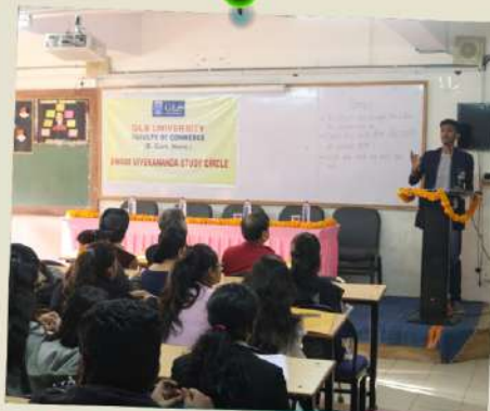
Inter-Collegiate Swami Vivekananda Elocution Competition