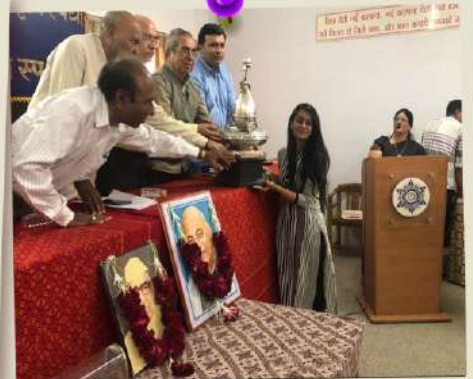
Debate Competition Winner