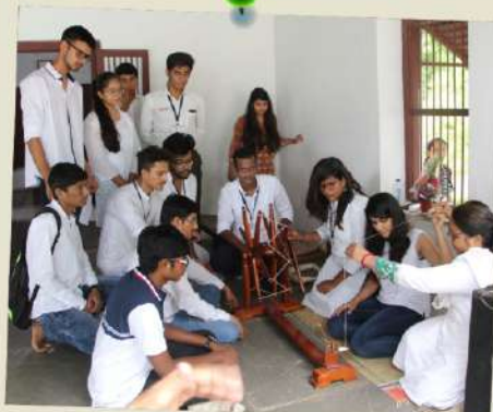
Visit to Gandhi Ashram