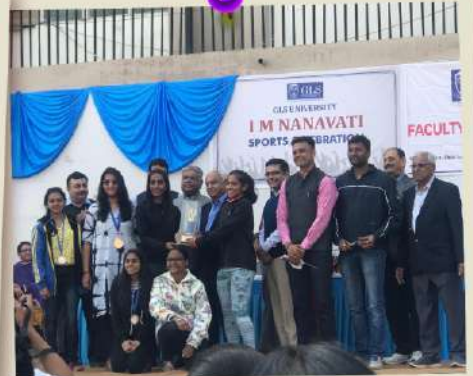
Sports Meet Winners